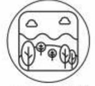
1 ACRE PARK

Corporate Office : GT House, #81, Dr.Alagappa Road, Purasaiwakkam, Chennai - 600084.